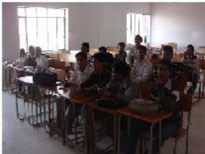
CLASS ROOM 5