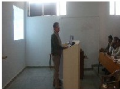
CLASS ROOM 3