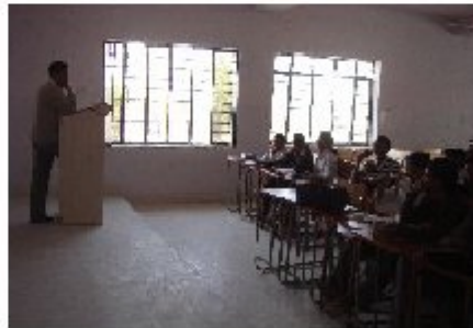
CLASS ROOM 2