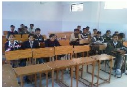
CLASS ROOM 4