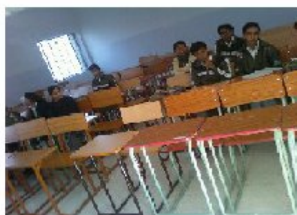
CLASS ROOM 6