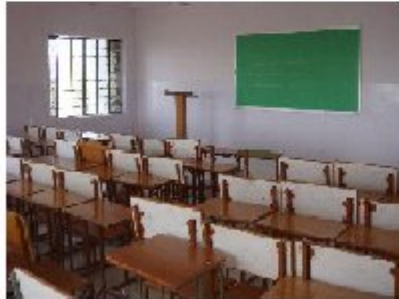
CLASS ROOM 1